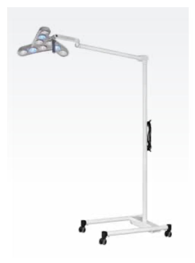
TRIANGO 100 F roller stand