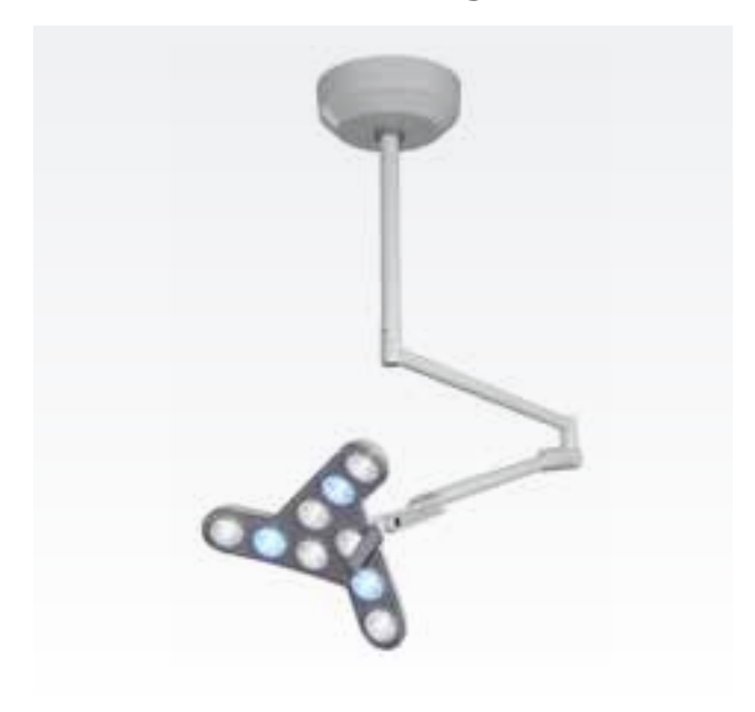
TRIANGO 100 C ceiling version