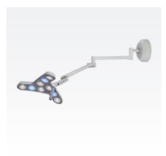
TRIANGO 100 W wall mount