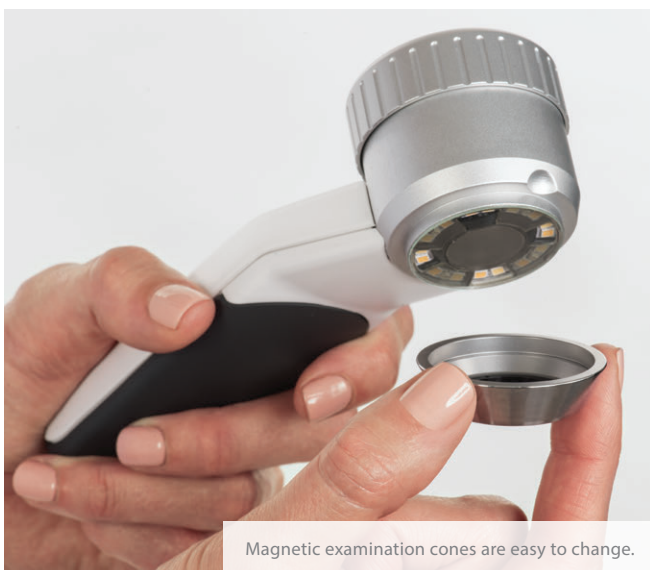
Magnetic examination cones are easy to change.