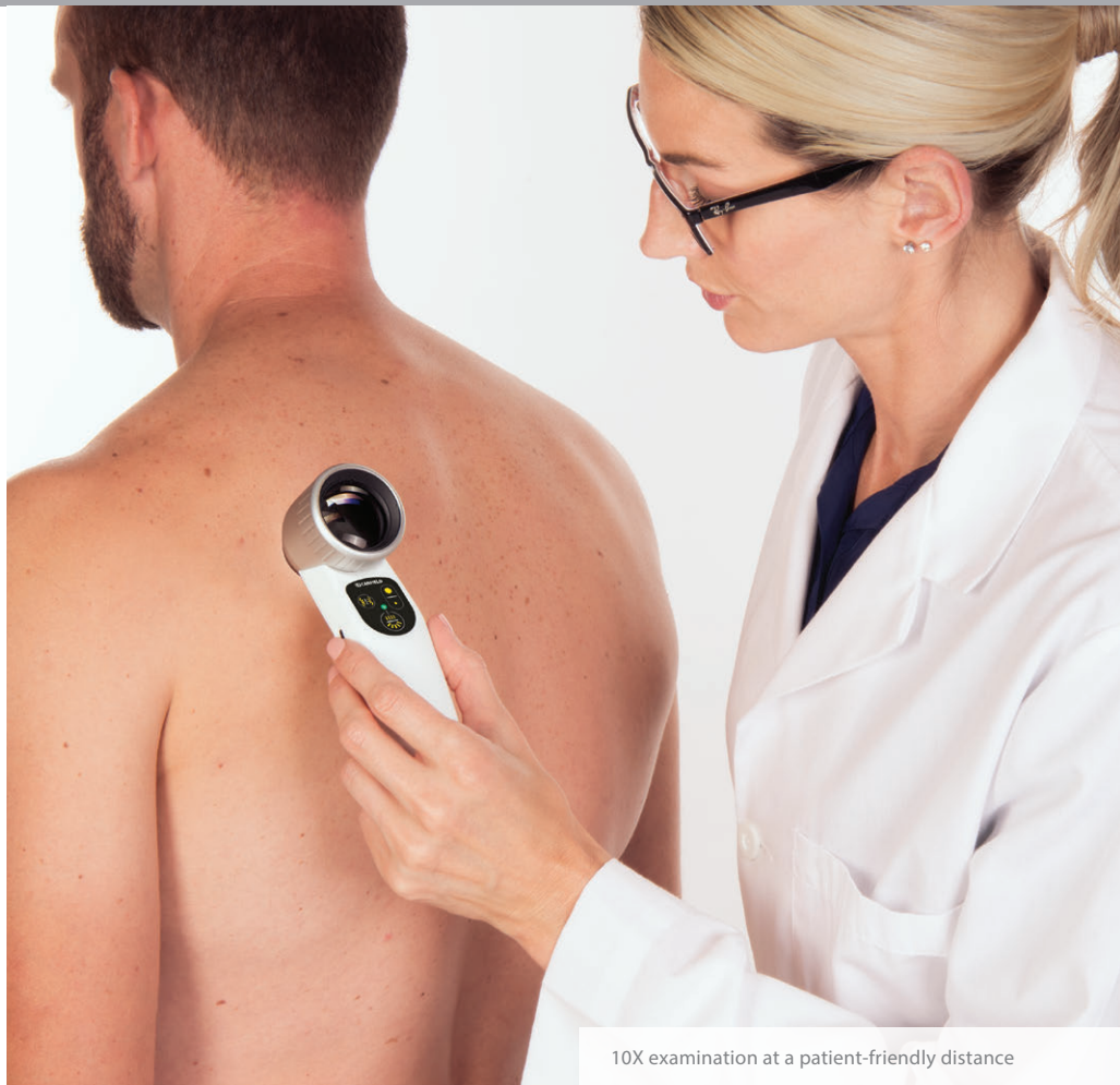
10X examination at a patient-friendly distance

The microprocessor-controlled light mixture of Luminis allows color reproduction close to natural daylight.